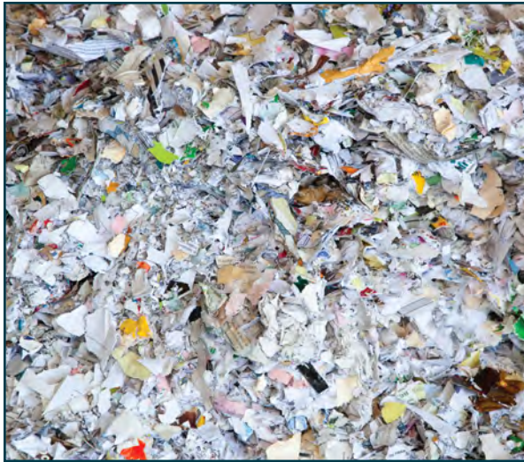
Example of shredded materials.

At the federal level, HIPAA (healthcare) and Gramm-Leach-Bliley (financial) require specific physical safeguards such as shredding to be in compliance.