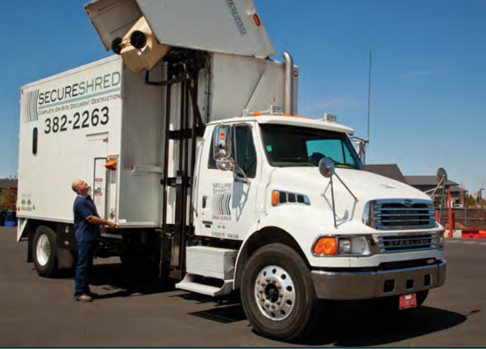
State-of-the-art truck shreds on-site.