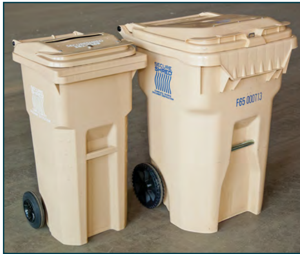
35-gallon and 65-gallon locking roll carts.